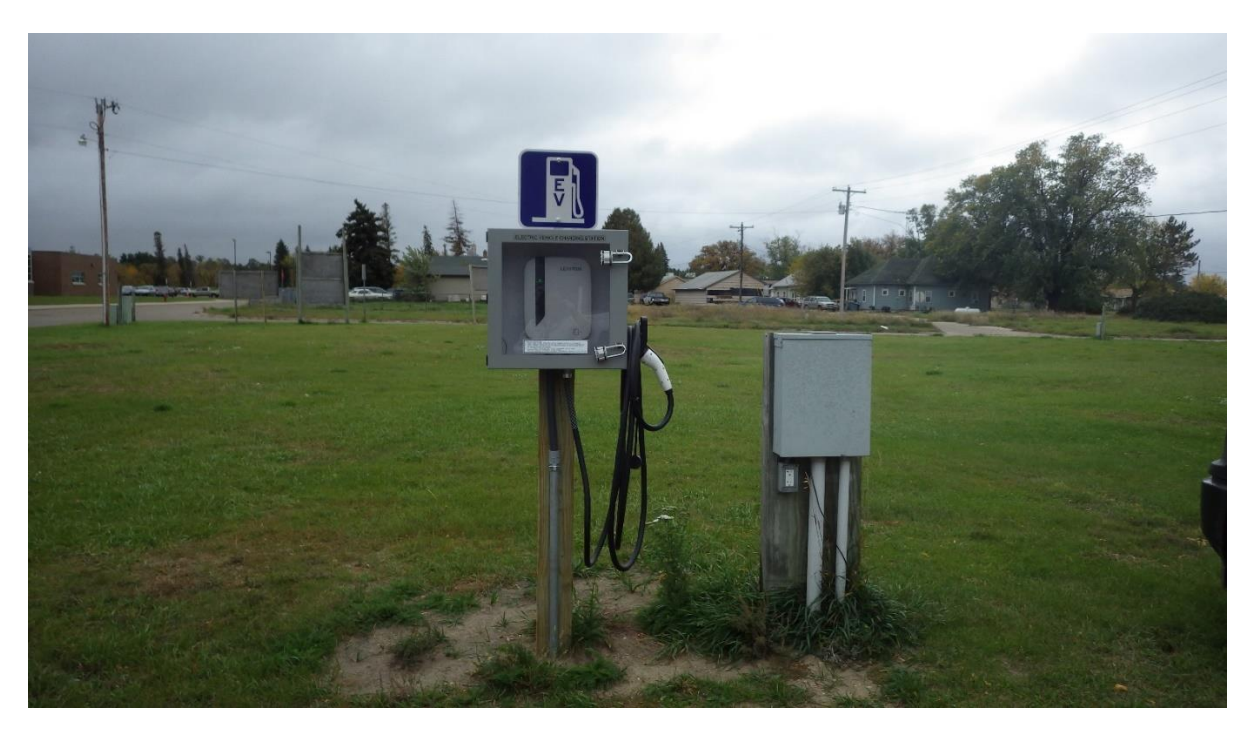
Figure 3. EV charging station at the Red Lake Department of Natural Resources, installation complete 8/3/2020.

Any modification to each approved Eligible Mitigation Action (including changes to equipment costs, tribal cost share, etc.):