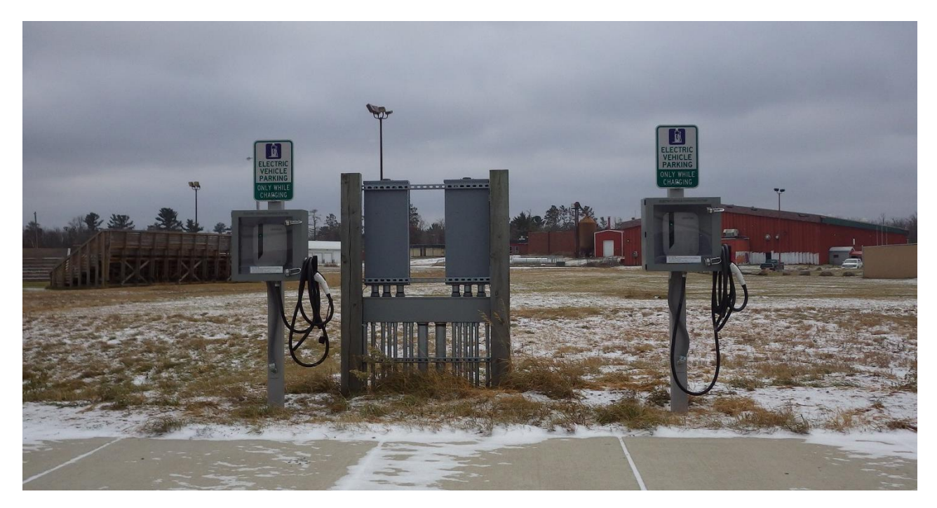
Figure 1. EV charging stations at the Red Lake Nation College, installation complete 8/3/2020.